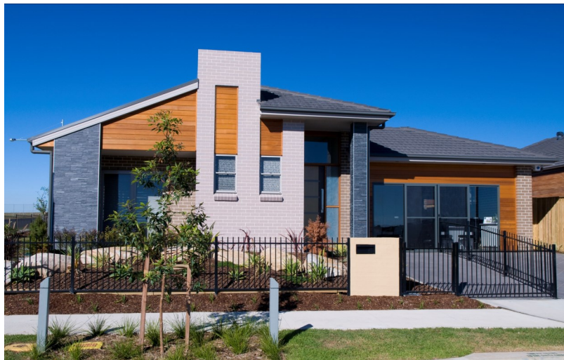
Oran Park Display Home