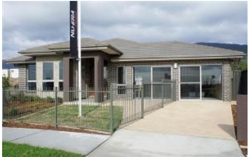
Dapto Display Home at Brooks Reach